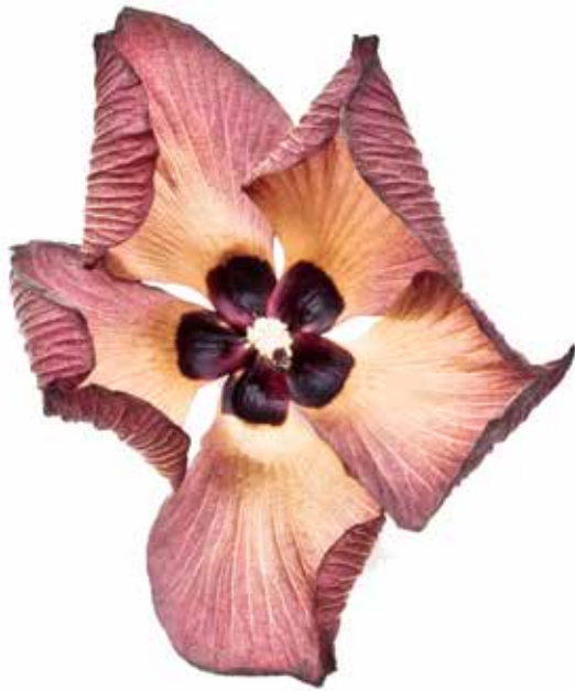
Sea Hibiscus ( Talipariti Tiliaceum )

Beautifully integrated into the backdrop of an ancient rainforest, along a winding stream, The Spa offers an immersive journey of holistic well-being in harmony with nature and one's natural self. Enveloped by the tranquil sights and meditative sounds of the jungle, each of The Spa's five secluded open-air treatment villas features indoor and outdoor showers and a spacious river-view soaking tub - perfect for one or a couple.